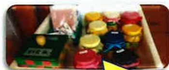
Seasonal handmade jam are popular.

This is an unattended stand made by the islanders. You can buy fresh vegetables and eggs. I recommend the vegetables and fruit jam. Jam is 200 yen. The picture on the wall were drawn by students from Hisaka.